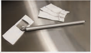
Cleaning Handle with Pivoting Head and Lint Free Mop Heads