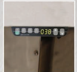
Programmable Electrical Stand Height Adjustment