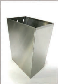
Stainless Steel 9" x 14" Garbage Can