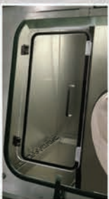
Unidirectional (Laminar) Airflow Antechamber