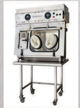
Benchtop Models Available