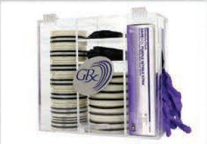
Rapid Exchange GRx Glove System