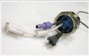
Sealed Data Port Passage