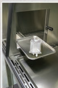
Stainless Steel Sliding Work Trays from Antechamber into Work Area