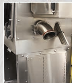
Ergonomic Placement of Sharps and Waste Tubes to Accommodate Different Sized Sharps Containers