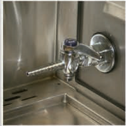
Stopcock for Air, Gas or Vacuum