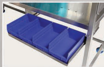
Drawers Under Workdeck can be Mounted on Right, Left or Both Sides