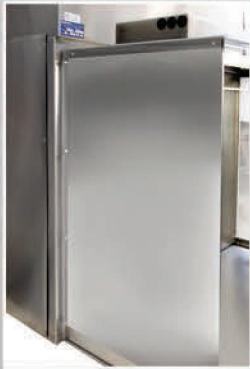
Stainless Steel Side Panels