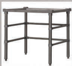
Stainless Steel Stand 30" or 36" High