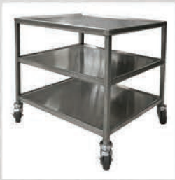
Bin Cart for Storage Under Workdeck 30" W x 26.5" D x 29" H (Includes 12 Bins)