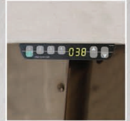
Programmable Electrical Stand Height Adjustment