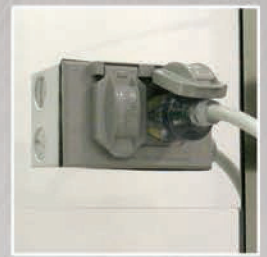
Duplex Outlet in Work Area