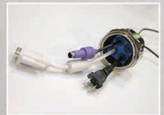
Sealed Data Port Passage